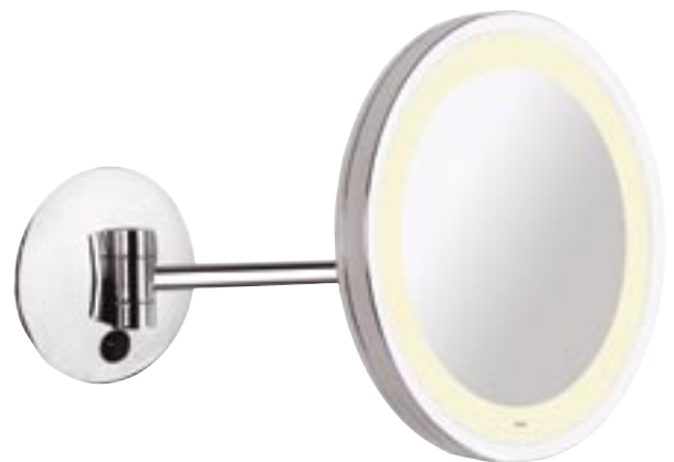
LED CITY LIGHT

Single arm. 3x magnification. Covered backplate. Full pivotal adjustment. Finish: chrome. Ø 240 mm.