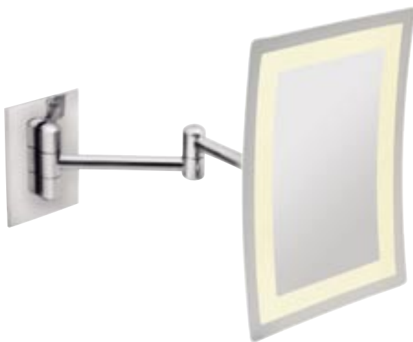
LED LUNATEC MINIMALIST

LED-lighting. Twin arm. 3x magnification. Ultra-thin profile. Full pivotal adjustment. Hard wired. 220 - 250 V. Covered backplate. Finish: chrome. 215 x 215 mm.